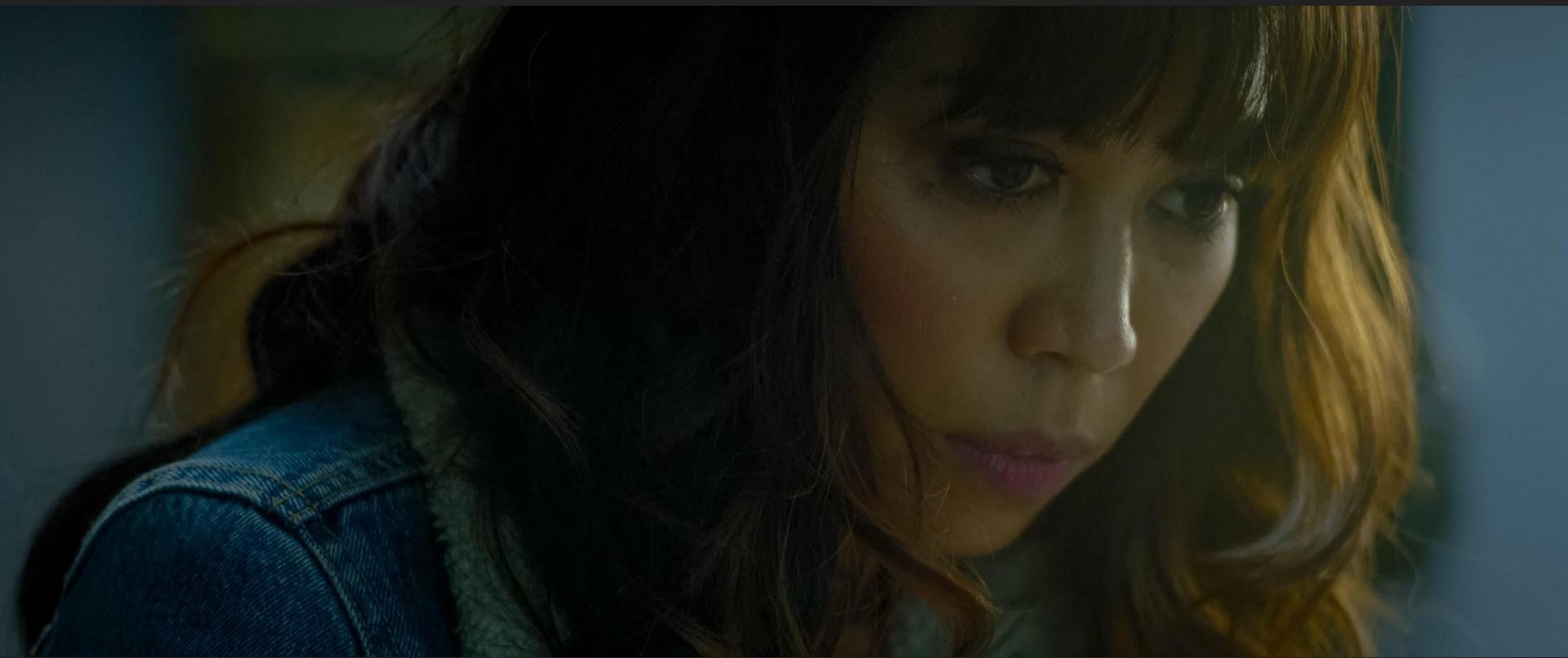
Still from The Patients / Tess Paras